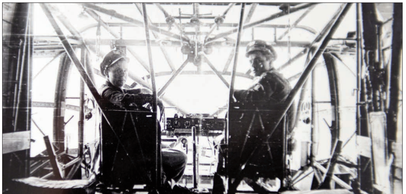
Glider pilots weren't fragile, but with the aim at making them as light as possible, they didn't exactly inspire thoughts of sturdiness. Most of the gliders were built in Minnesota. One of them has been restored and is now on display at the Fagen Fighters WWII Museum in Granite Falls.