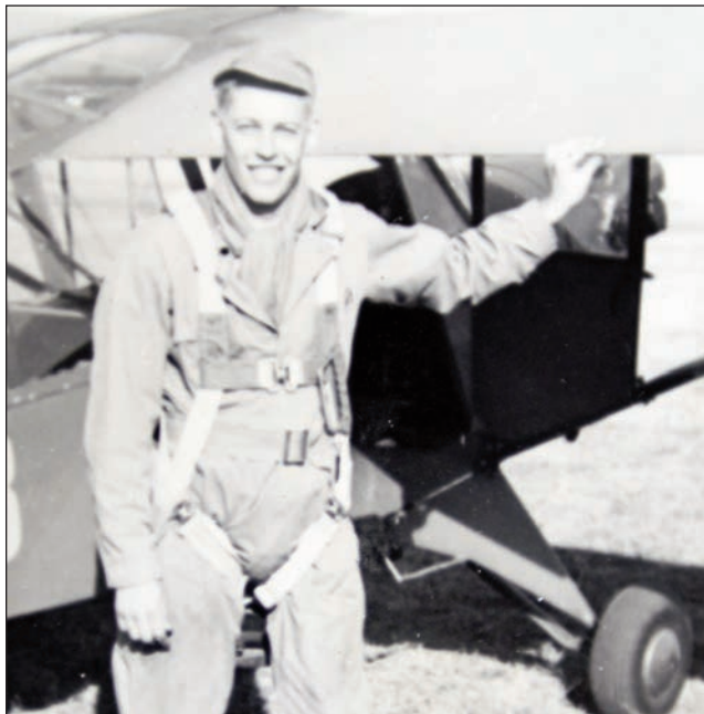
Glider pilots first trained on Piper Cubs, and had to turn the engine off and land them with a dead stick.