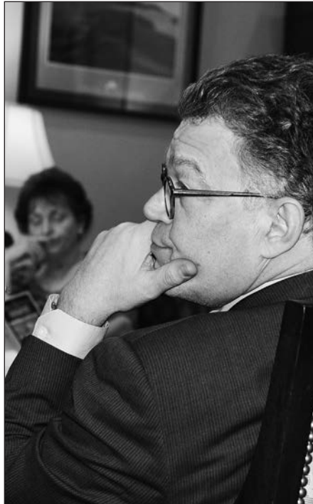
Sen. Al Franken, D-Minn., ponders an issue raised by the Minnesota delegation at the Washington Conference.