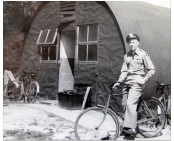
Home in England was a Quonset hut. The soldiers got around on bicycles.