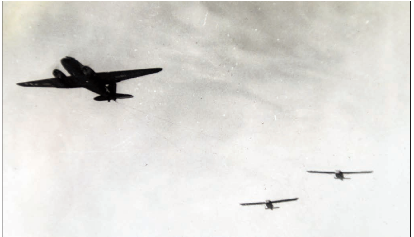
A C-47 tows two gliders during the war. Both the transport pilot and the glider pilot could release the tow rope if need be. The glider pilots only took over total control of the aircraft with about two minutes left in the mission. On D-Day, they had to land with no lights or landmarks.

They asked him what he was firing at, and he said he thought he heard a German in the brush and so he fired.