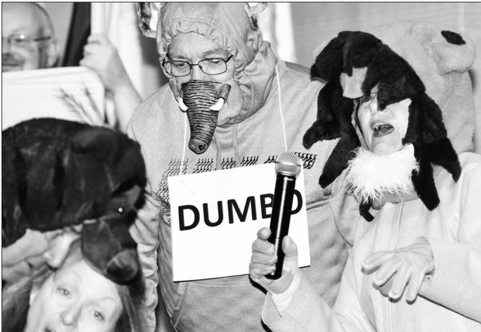
Animals filled the stage during the 2014 Extravaganza at the Convention.