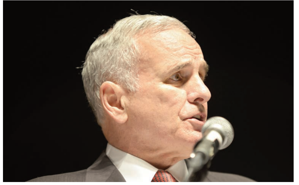
GOV. MARK DAYTON