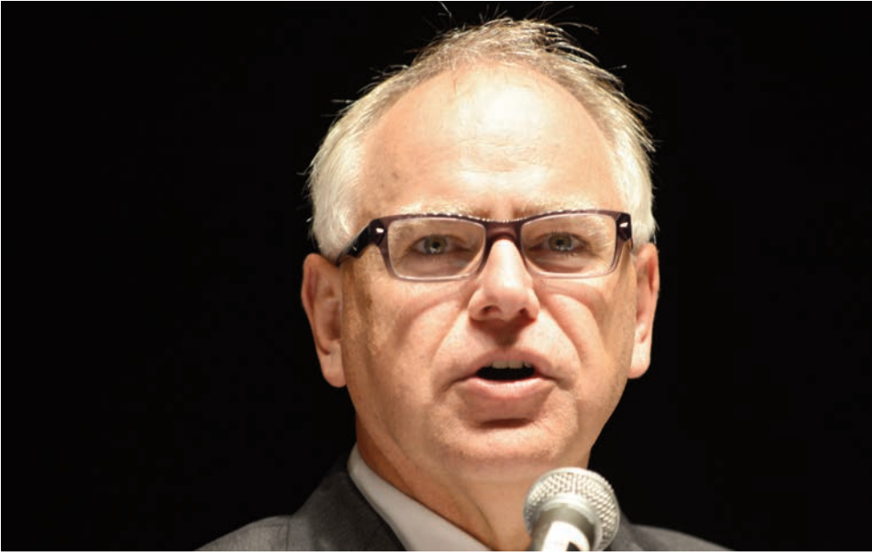
REP. TIM WALZ, D-MINN.