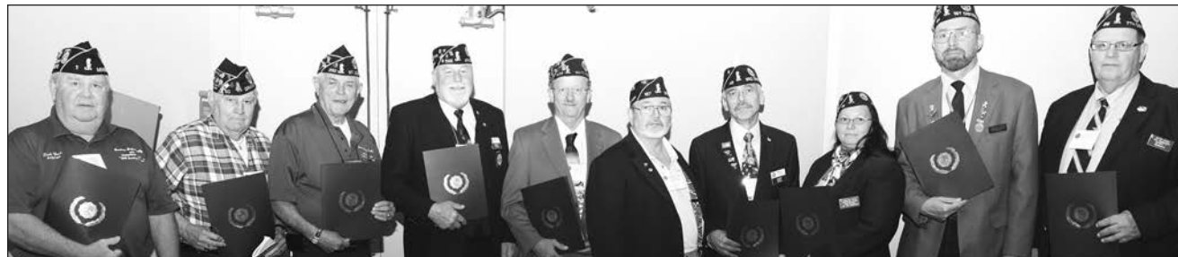
AMERICANISM CERTIFICATES -- Americanism citations were presented to posts in the 10 districts and representative came forward to pick them up at the convention. Those posts that received citations were Preston Post 166, Winnebago Post 82, Mahtomedi Post 507, St. Paul Hamline Post 418, Minneapolis Post Office Post 540, Waite Park Post 428, Clinton Post 258, Littlefork Post 490, Crookston Post, Nels T. Wold Post 20, St. Louis Park Post 282.