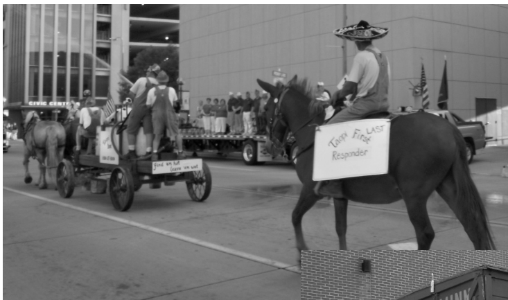
Picture to the Left :Taopi first and last responders approaching the viewing stand during the Minnesota Department Convention Parade