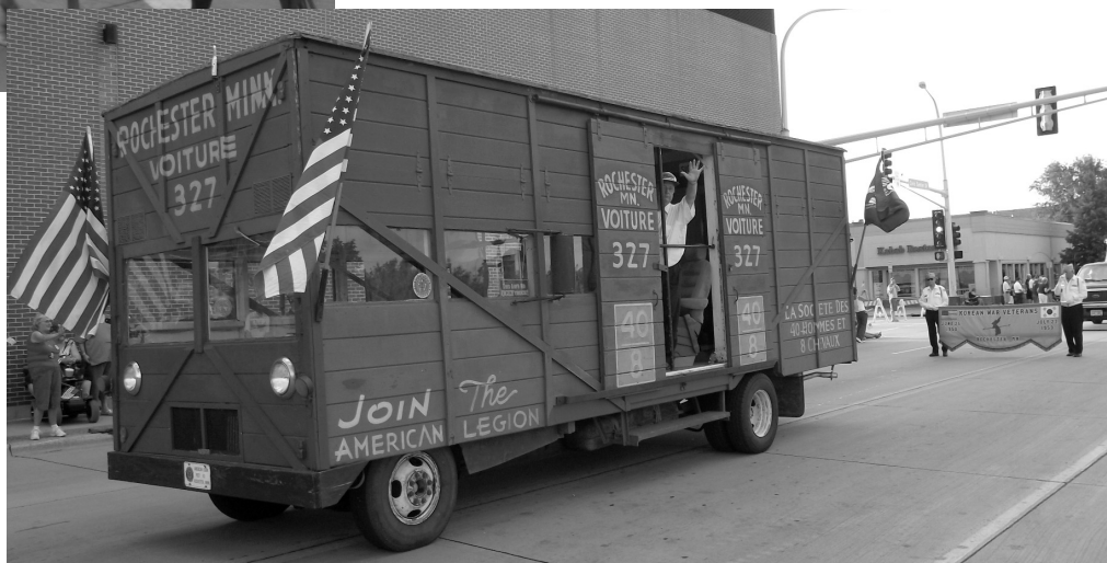
Picture to the Right: Voiture 327 Boxcar in Minnesota Department Convention Parade