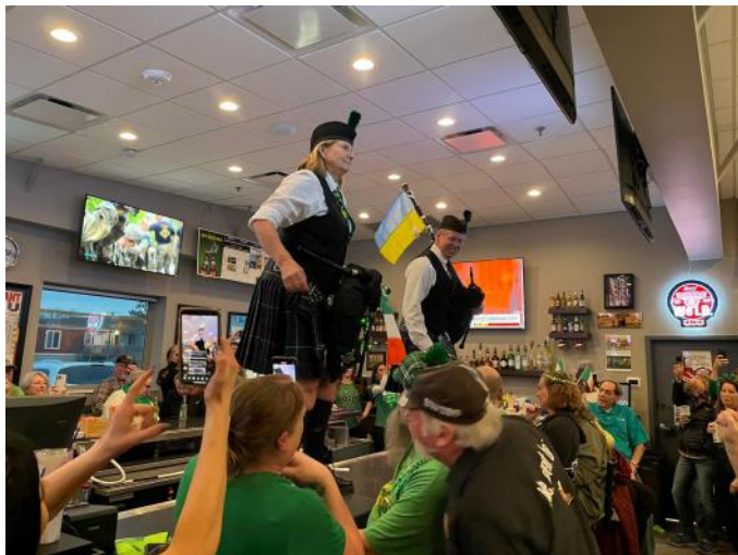
Rochester Caledonian Pipe Band at Wm. T. McCoy Post 92