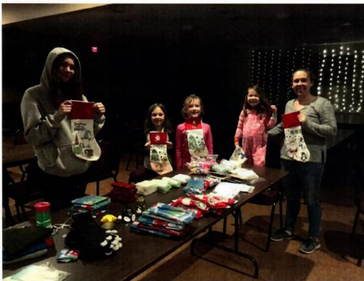
Some of the Stewartville Jr Auxiliary members decorating Christmas Stockings. They were filled with Christmas goodies to be distributed to soldiers thru the Holiday Stockings for Heroes program