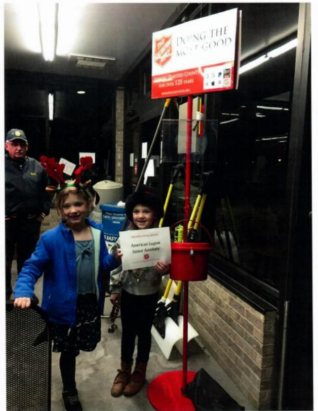
A couple of the Stewartville Unit 164 Jr Auxiliary members helping the Stewartville Sons of the American Legion with ringing the bells for the Salvation Army Res Kettle program.