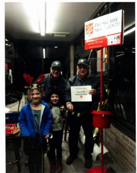
Stewartville Sons of the American Legion along with the Stewartville American Legion Auxiliary Jr's ring bells for the Salvation Army red kettle program..