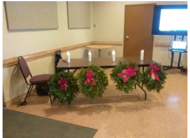
The table of remembrance for the "Immortal Four Chaplains" Program which was held during the First District Mid Winter