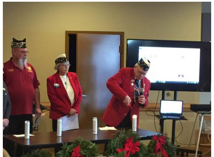
Commander Wellik lighting the candle of remembrance for one of the Four Chaplains during the Four Chaplains Program