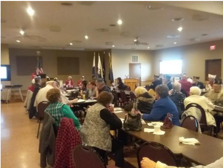
More members present at Mid Winter