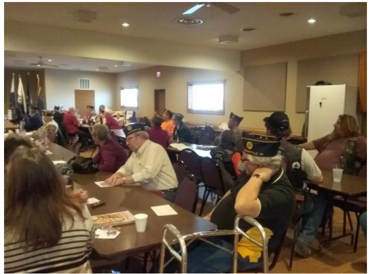
A view of some of the members attending the First District Mid Winter