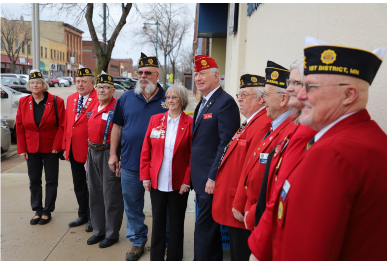
First District Officers with the National Commander at Owatonna Post 77