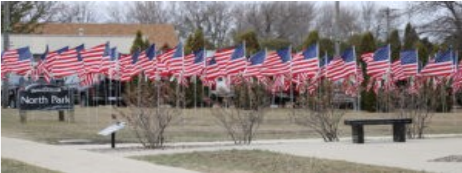
Dodge Center Memorial Field of Flags during the National Legion Commander’s visit