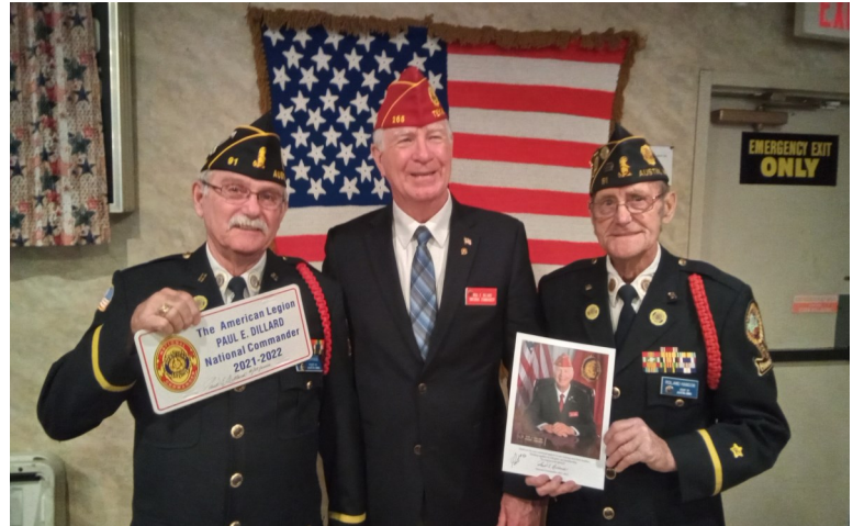
Members of the Austin Color Guards with the National Commander at Austin Post 91