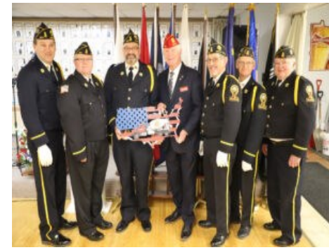
The National Commander standing with the Dodge Center Color Guard