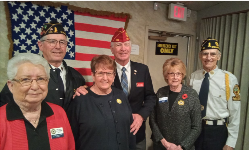
A group of Legion and Auxiliary members with the National Commander at Austin Post 91