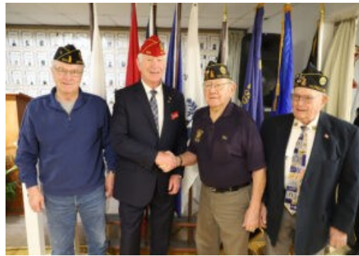
National Commander with Hayfield post 330 members at Dodge Center