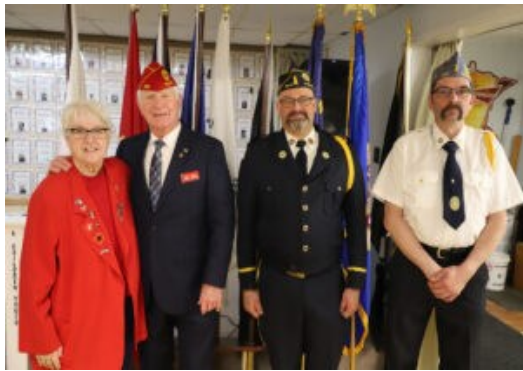
National Commander with Post 384 officers