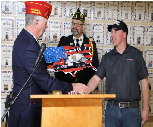
The National Commander receiving a gift from Con-Tech Manufacturing of Dodge Center