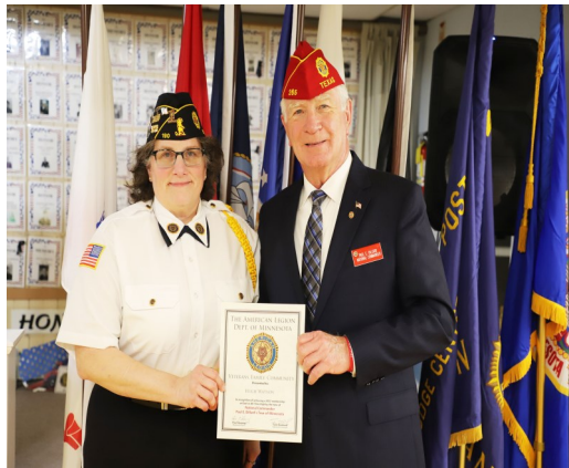
St Charles Post with 100% certificate Ke standing with the National Commander