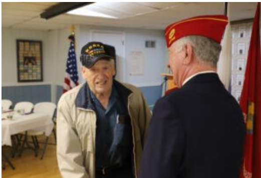
National Commander greeting a Korean Veteran at Dodge Center post 384