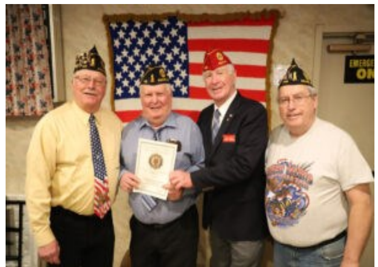
Adams post 146 members holding their 100% membership certificate with the National Commander at Austin Post 91