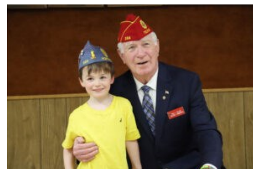
Below The National Commander with a SAL member from Hopkins at Owatonna