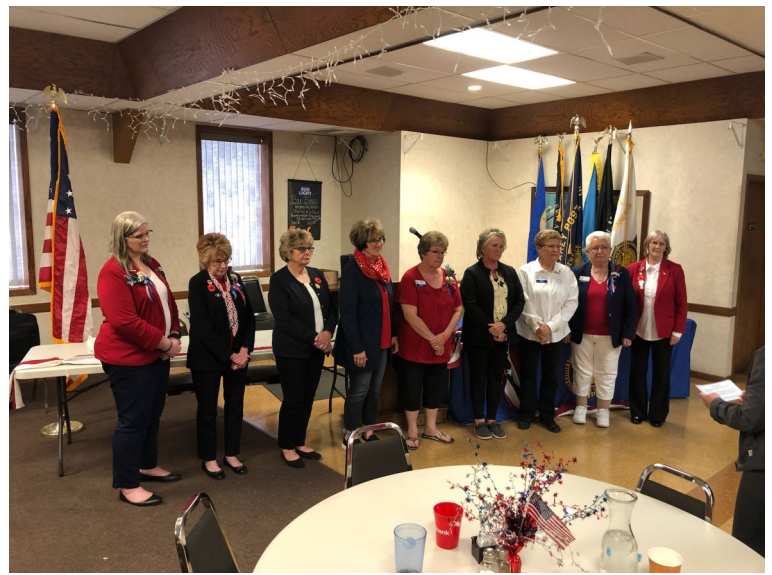
2022 - 2023 First District American Legion Auxiliary Officers who were elected at the First District Convention in May