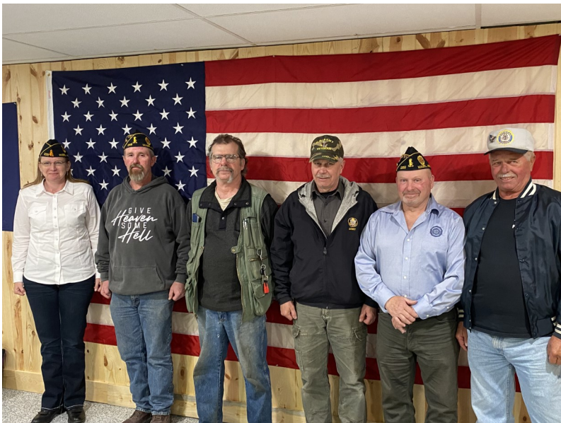
New officers for Mabel Post 299 for the 2022—2023 year