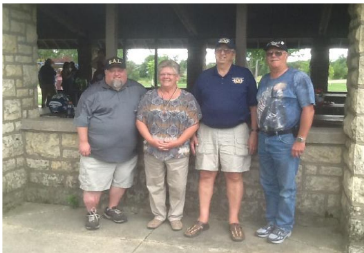
The First District Leadership team for 2017—2018