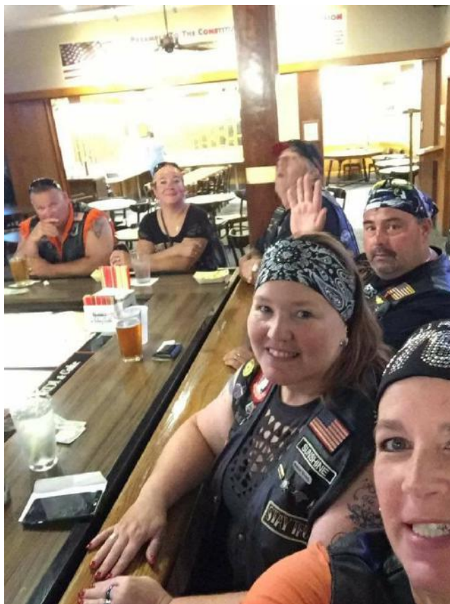
Above and to the left - Presenting the Legacy donations from across the 1st District at the State Legacy Scholarship Run at Owatonna Post 77.