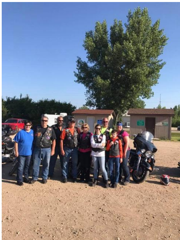
1st weekend on the Department Legacy Ride. This is a picture of all the First District people on the ride! Great cause and had a great time.