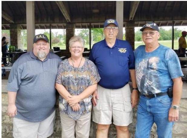
District 1 American Legion Family 2018 Leadership team.

I always get right to the point, so here it is....let's all have an awesome and exciting year in our District 1 American Legion Auxiliary Family! I am humbled to be surrounded by an extremely talented and ambitious Executive Board, as well as the Committee Chair members alongside our Legion Family Leadership members (see photo below).