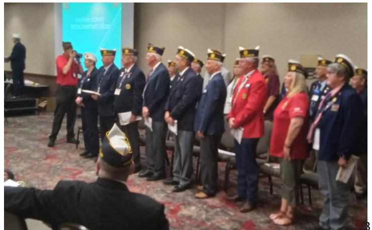
Far right—The Department officers for the 2022—2023 year