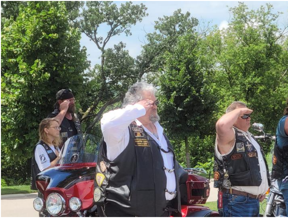
Images on this page are from a Funeral escort done by the Eyota ALR