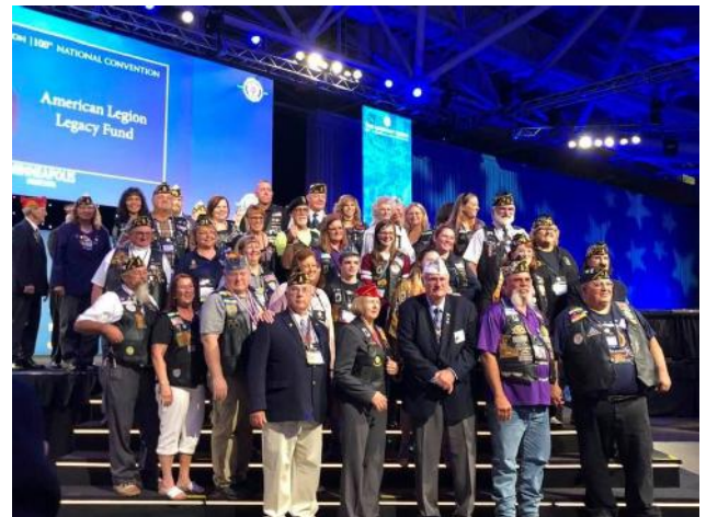
Minnesota ALR getting their picture taken after presenting a check for $251,000 to the National Commander