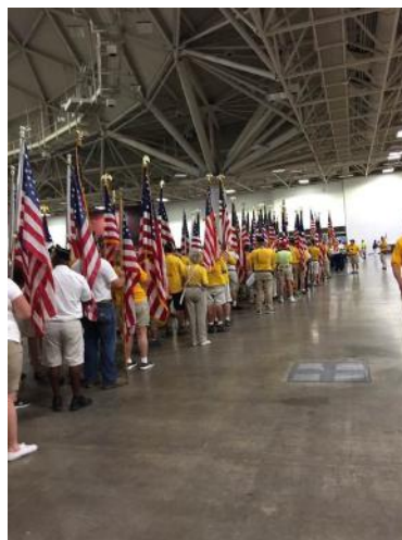
Part of the Minnesota parade members lining up.