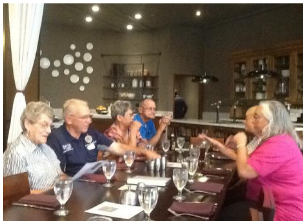
First District supper at the Hyatt Regency Hotel