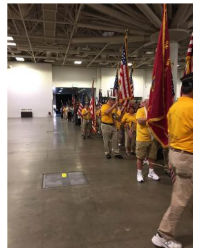
More of the parade line up