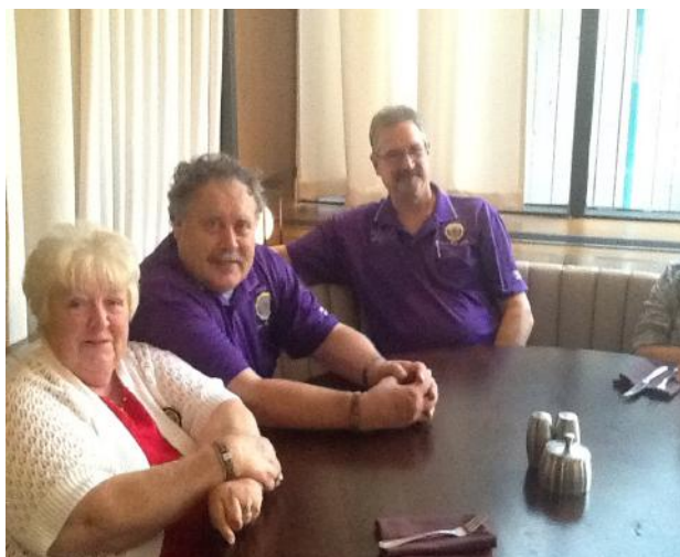
Too many members attending for the long table