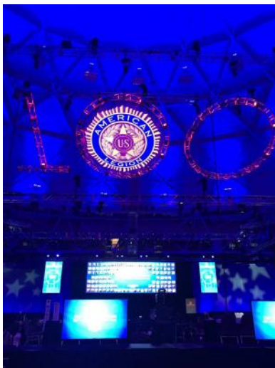
Overhead hall A of the Minneapolis Convention Center