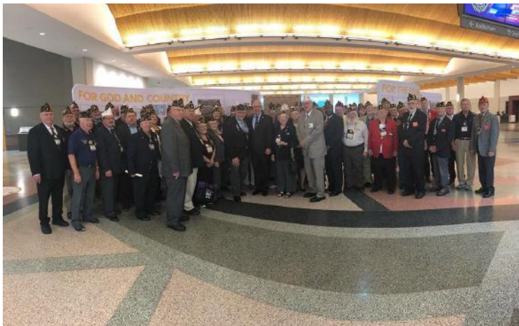
MN delegation with congressman Tim Walz