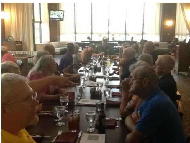
Another view of the members attending the supper