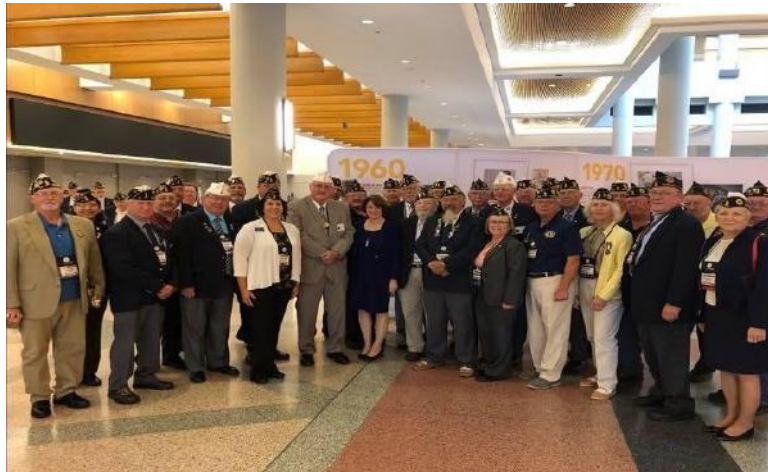
MN delegation with Senator Amy Klobuchar