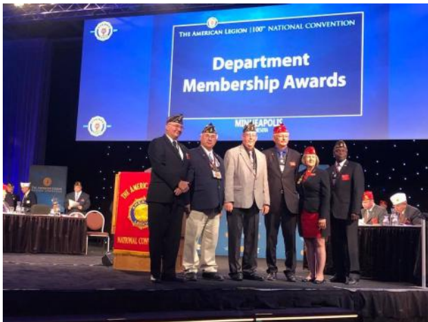
2017 –2018 Department of Minnesota receiving their membership award.