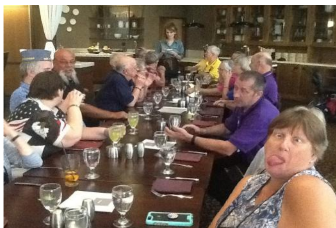
More members at the supper