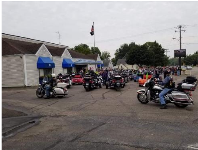
Above and on the right—picture's of the National Legacy Run's stop at Austin Post 91