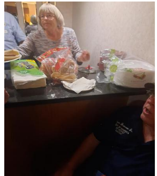
ABOVE - PICTURES FROM THE FIRST DISTRICT OPEN HOUSE AT DEPARTMENT FALL CONFERENCE