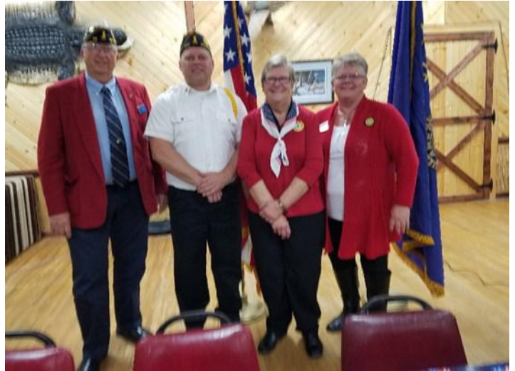
Membership /Veterans Day Dinner in Kellogg