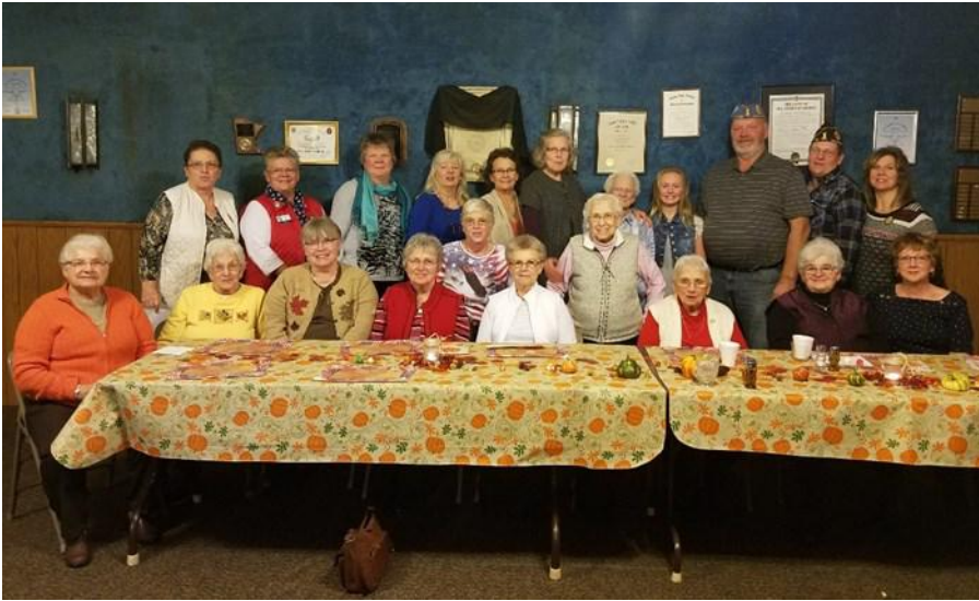
A very delicious meal was served at the Adam's ALA Unit meeting. A special presentation was made to a Poppy Poster winner that was recognized at the Northwestern and National levels.