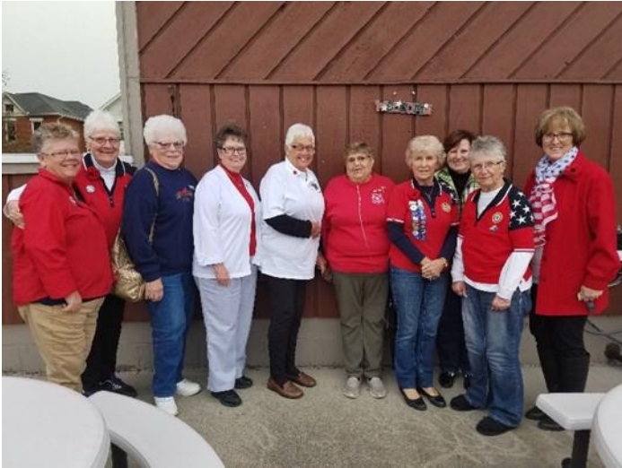
Visiting the Wabasha ALA Unit meeting

November took me to the Owatonna Unit Meeting on the 7 th , the Adam's Unit meeting, the Wabasha Unit meeting, the Kellogg Veteran's Day Program on the 11 th , the Lake City Veteran's Dinner, the LaCrescent Unit meeting, the Waldorf Unit meeting, in the morning, and District 1 Rally in St. Charles. One thing I've been realizing as your District President is that each Unit that I have visited all serve delicious food. All kidding aside, everyone seems to have their own little niche with projects that serve veterans. I was duly impressed with Owatonna and the way that they partner with their Sons of the American Legion for projects. I spoke at veterans dinners as well as the Unit meetings- bringing updates of the District and Department. Please let me know if your Unit would like me to visit.