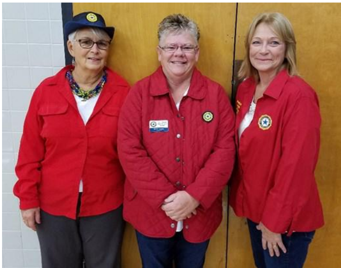
Attended the Veterans Day program in Plainview.

I also attended the Elgin program; along with the Wabasha Veterans Day program at their high School where I experienced a profoundly remarkable and moving POW/MIA ceremony provided by the Wabasha ALA Unit.