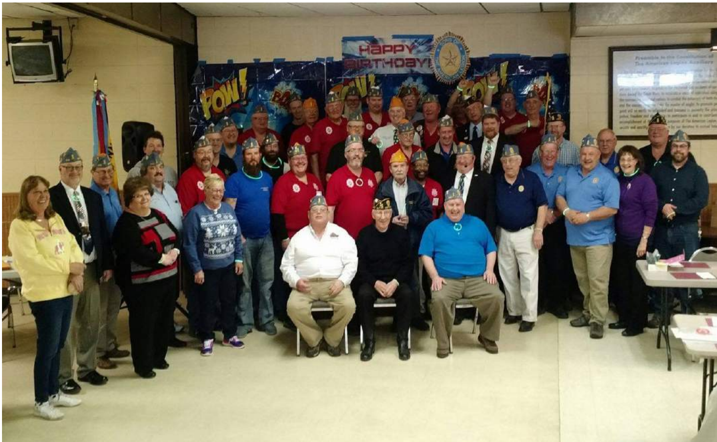
SAL members present at the Detachment Spring Conference in La Crescent, MN