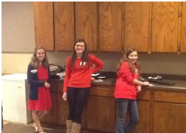
First District Jr members working on the Honorary Department president's project of socks for veterans.