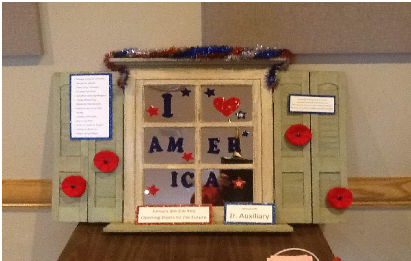
Above - The winning poster at the First District Auxiliary Jr Conference - Below— Food for thought