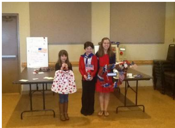
Poppy contest winners