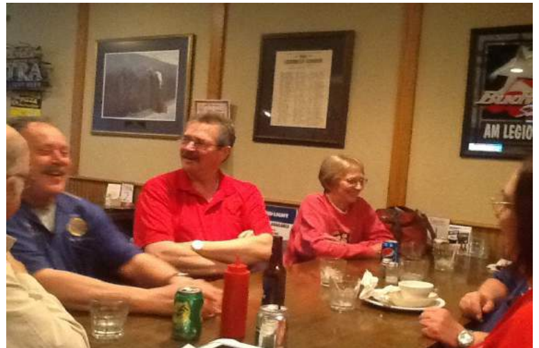
Members present at the Past Commander/President fish fry in La Crescent Post 595