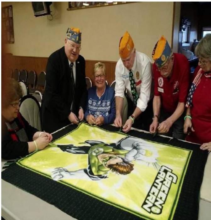
Making a tie blanket for the Child Welfare auction