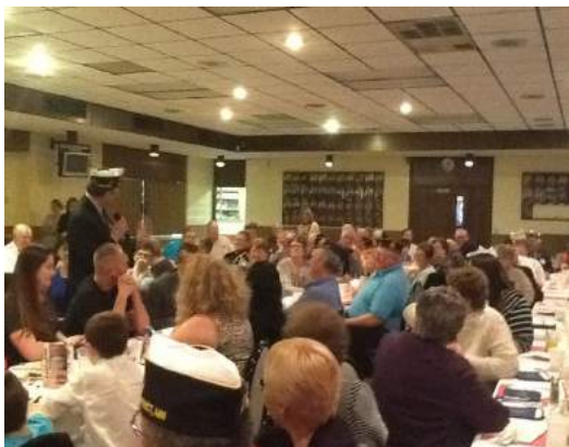
Members present at Sy's testimonial supper