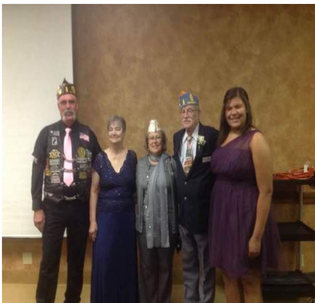
Our Department Leadership Team