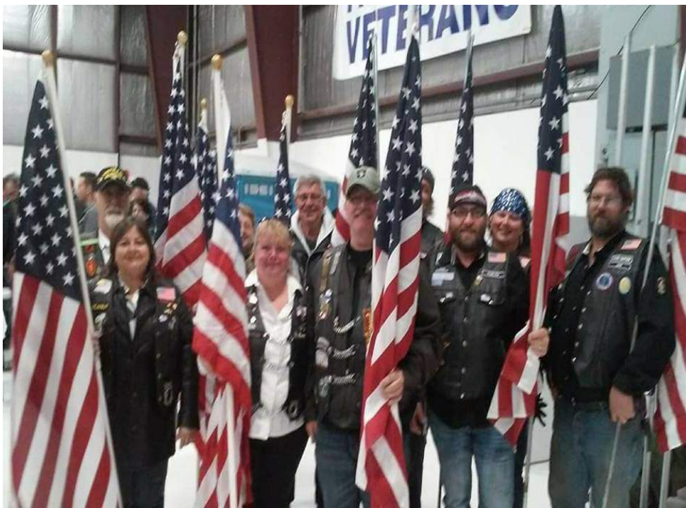
First District Riders at a Honor Flight welcome home.