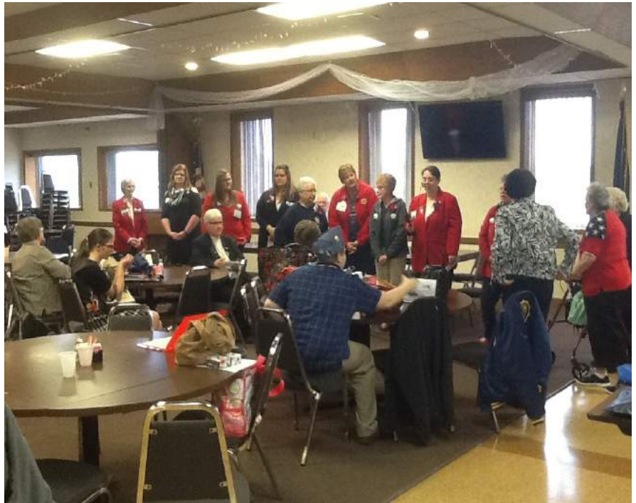
The newly elected First District American Legion Auxiliary officers being installed at the First District Convention in Albert Lea.