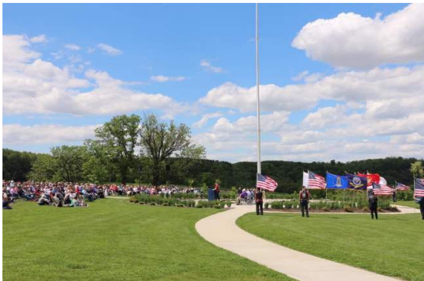
A view of the crowd at the Memorial program at the Preston State Cemetery on Sunday May 25, 2017