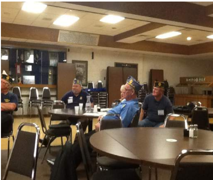
Members from Rochester, Albert Lea and Glenville Squadrons present.