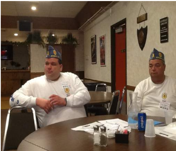
Winona squadron 9 members present.