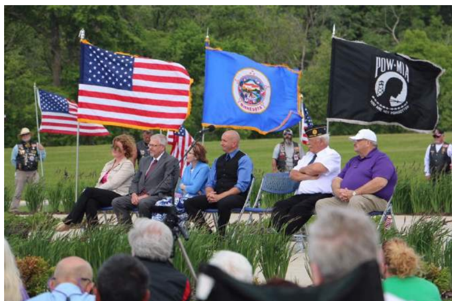
A portion of the speakers for the program at the Preston State Cemetery memorial program