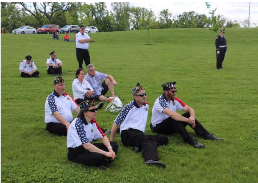
Some of American Legion Post 190, St Charles, MN members at the memorial program