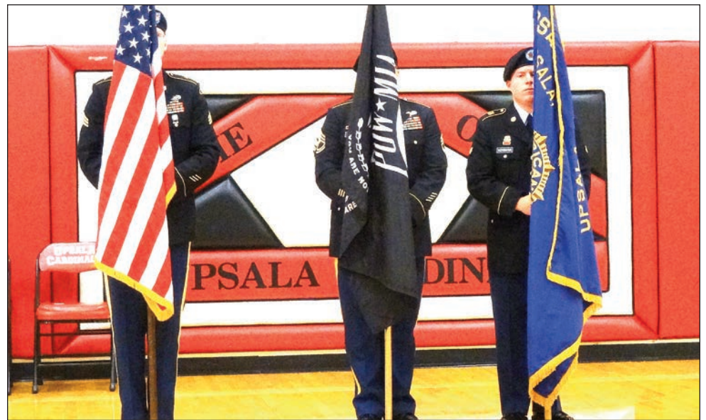
UPSALA HONORS HEROES -- Upsala Post 350 created a Wall of Honor at Upsala School where plaques are permanently on display with the names and pictures of classmate who were killed in war. Ten servicemen were honored, and their families were on hand to receive the plaques and say words about their loved ones before an assembly of over 600 people at the school.