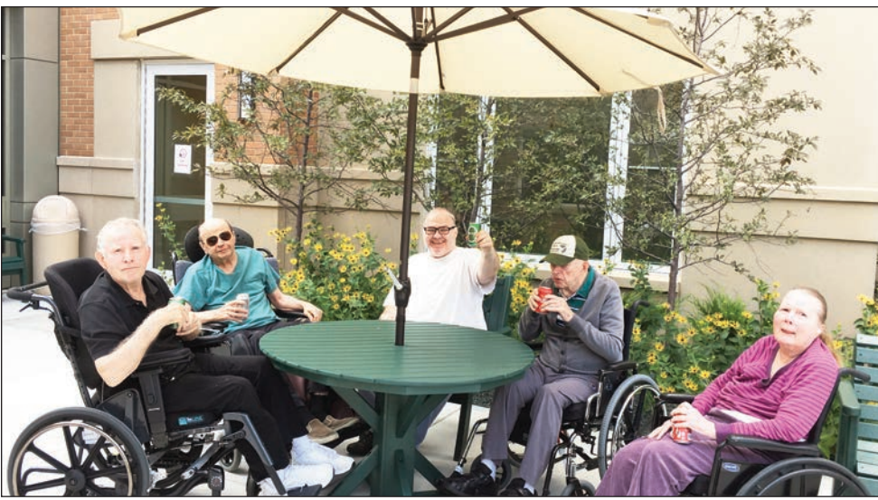
NEW PICNIC TABLE -- Bloomington Unit 550 purchased a new picnic table for the residents at the Minnesota Veterans Home in Minneapolis.