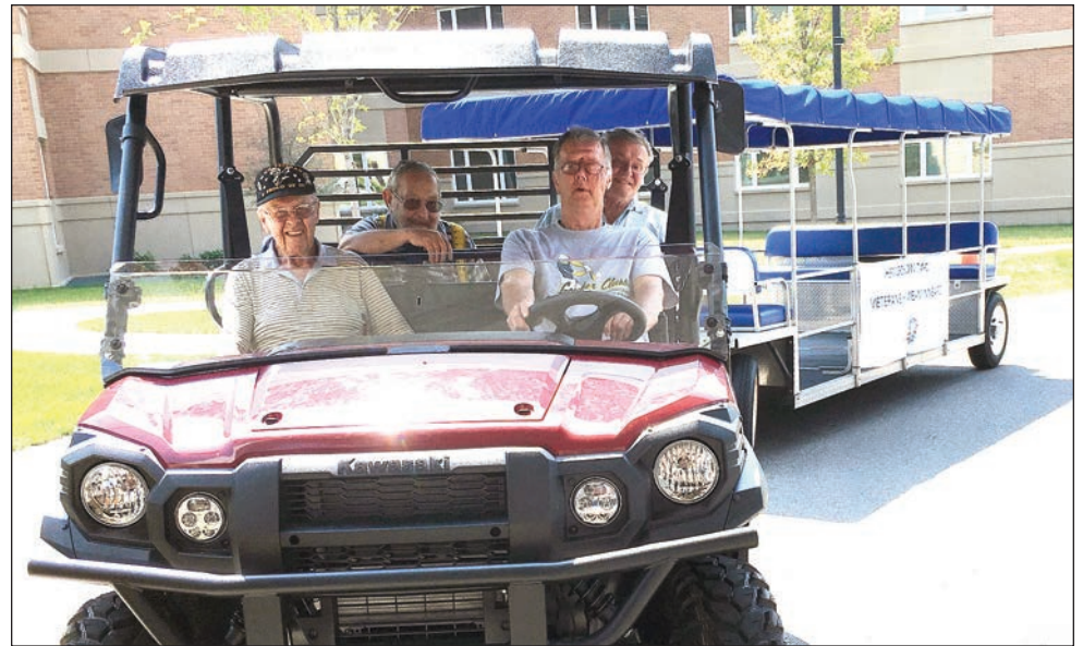
BLOOMINGTON POST TROLLEY -- Bloomington Post 550 found out that the 20-plus year-old trolley at the Minneapolis Veterans Home had become "the little trolley that just couldn't do it anymore." The post rehabbed the trolley including new seats and a canopy, and purchased a brand new Kawasaki Mule-Pro to haul it. It is now back in business so residents can take scenic rides to the river.