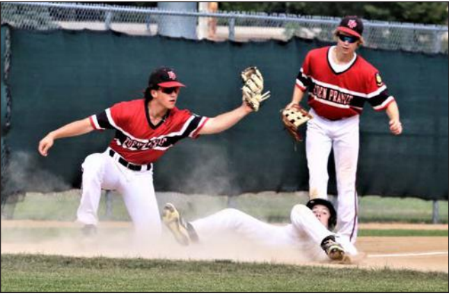
A New Prague runner slides as an Eden Prairie baseman attempts to make the tag.