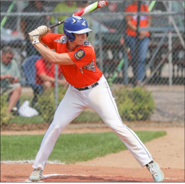
A Sacred Heart batter prepares to swing at the Div. II State Tournament.