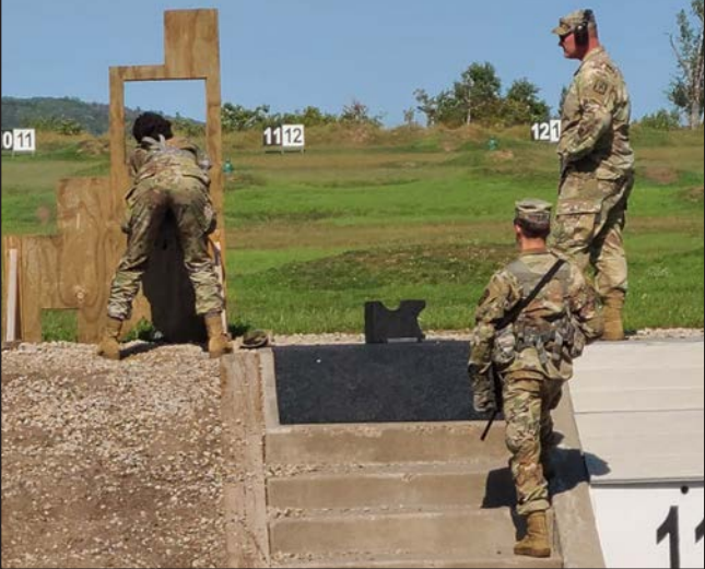
A tour of Camp Ripley on Sept. 18 went past the firing range. Soldiers these days fire from more positions than foxhole and prone. This one is leaning into a window.