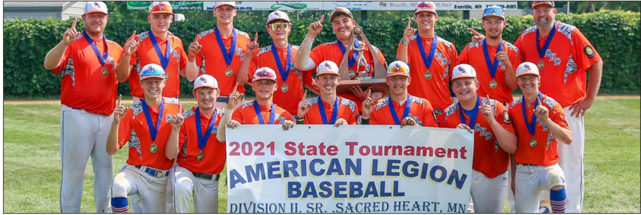
Sacred Heart won the Div. II Tournament by defeating Tri-Town 11-0. Tri-Town has players from the Atwater-Grove City-Cosmos district. Sacred Heart also was the host of the tournament.