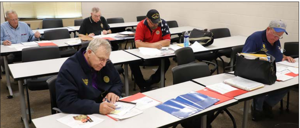
Members of the Department National Security & Foreign Relations Committee read and rank submissions for the Outstanding Enlisted Awards on Friday, Sept. 17. The winners are announced at the Fall Conference in Mahanomen. (See Page 7.) People often are surprised at how much work goes into soliciting submissions and picking winners.