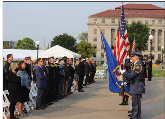
The St. Paul Police Department carried in the colors.