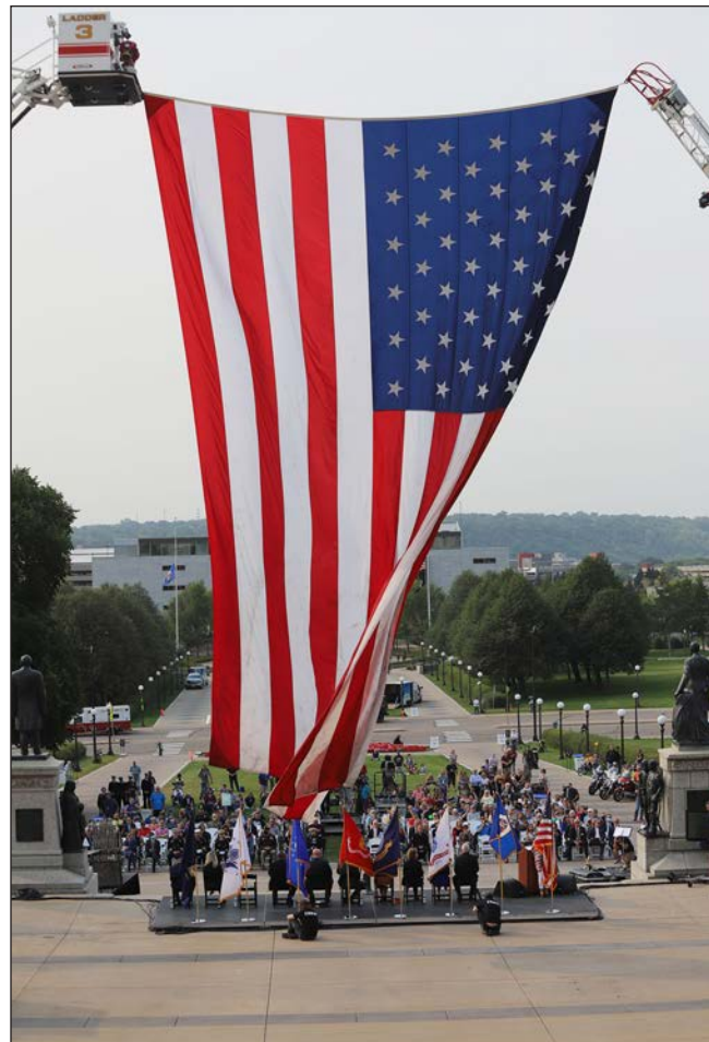
Ladder trucks from the Minneapolis and St. Paul fire departments hold a large American flag over the steps of the State Capitol on Sept. 11.