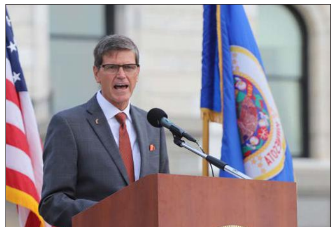
Retired Gen. Joseph Votel addressed the crowd in attendance. The former CENTCOM commander said the Afghanistan veterans made a difference in Afghanistan, the Mideast and the world. Votel grew up on St. Paul's east side.