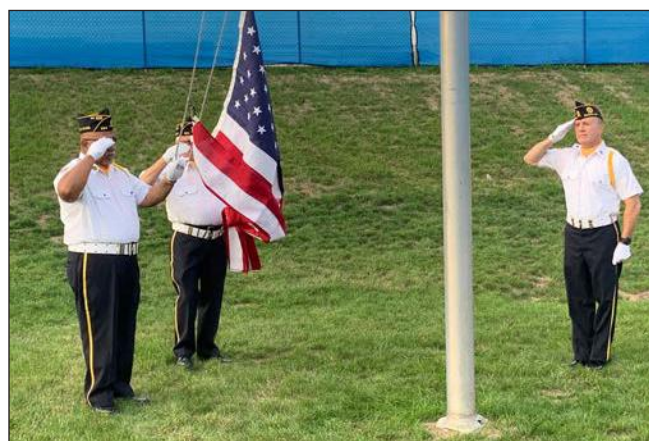
In the spirit of Americanism and youth, Eagan Post 594 donated and raised a new U.S. flag at the Eagan High School football stadium before the Eagan High School football game on Sept. 10. Members of the post also donated an additional flag for another sports facility.