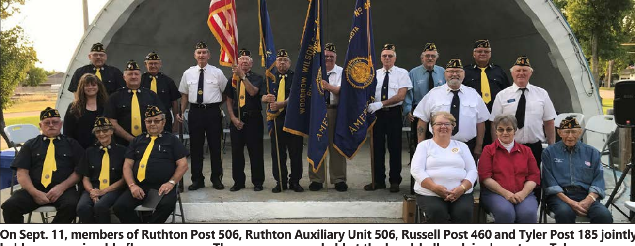
On Sept. 11, members of Ruthton Post 506, Ruthton Auxiliary Unit 506, Russell Post 460 and Tyler Post 185 jointly held an unserviceable flag ceremony. The ceremony was held at the bandshell park in downtown Tyler.