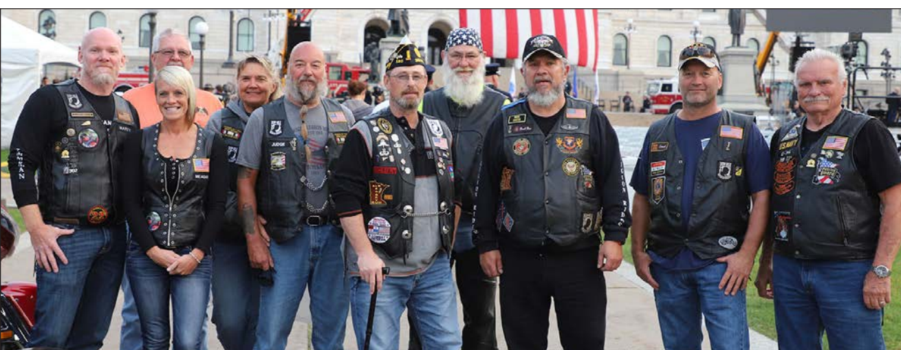
Minnesota American Legion and VFW Riders attended the 9/11 Day of Remembrance. Nationally, the American Legion Riders have raised over $17 million for the Legacy Scholarship Fund, which provides full-tuition scholarships to children of post-9/11 veterans who were killed or wounded in combat.