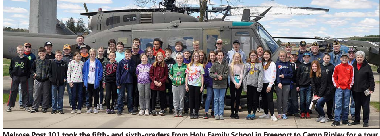
Melrose Post 101 took the fifth- and sixth-graders from Holy Family School in Freeport to Camp Ripley for a tour, including the Information Center and Minnesota Military and Veterans Museum. They even ate lunch with soldiers in the mess hall.