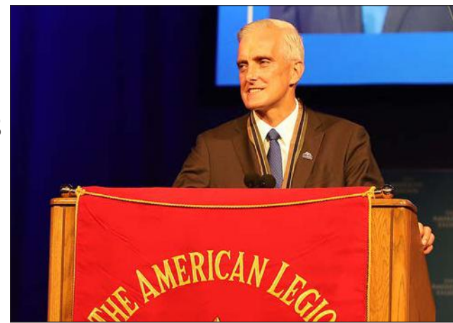
Secretary of the VA Denis McDonough addresses the National Convention on Tuesday, Aug. 31.

“They made a choice to run toward the fight, not away from