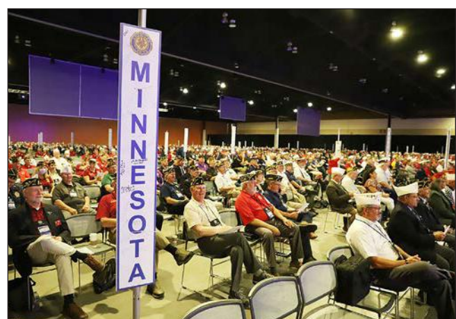
Delegates and alternates from Minnesota sat near a sign indicating their department. Each department has a department sign.