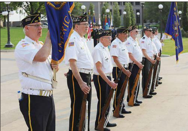
The Bloomington American Legion Post 550 and VFW Post 1296 Honor Guard was on hand to fire volleys.