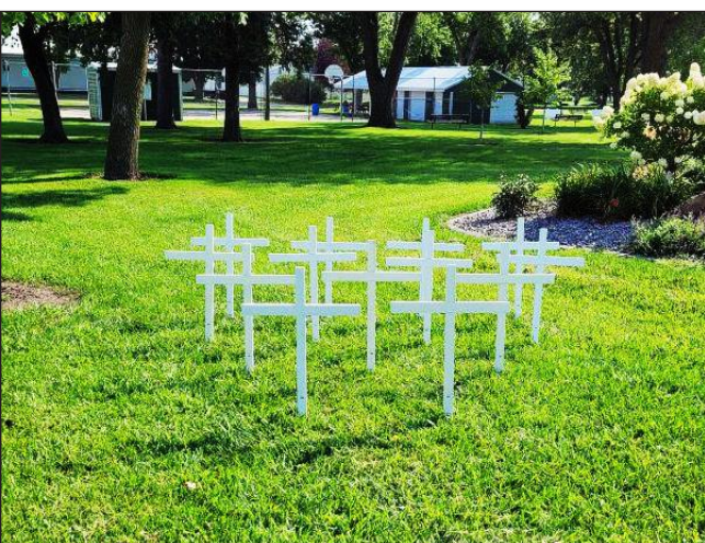
Thirteen crosses were posted outside Brewster Post 464 in tribute to the 13 servicemembers who died in the Aug. 26 terrorist attack in Kabul.