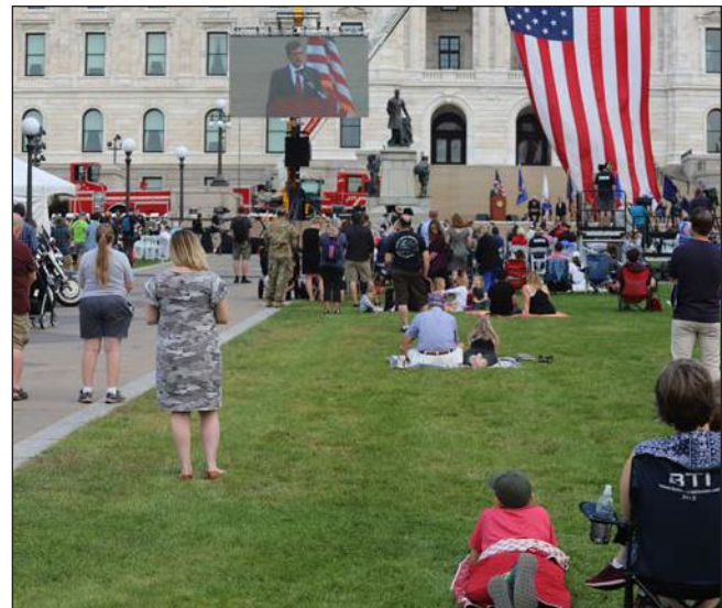
Turnout for the 9/11 Day of Remembrance was not as strong as organizers had hoped.