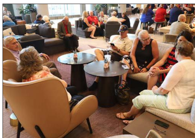
The lobby of the Sheraton Hotel in Phoenix was often a place to gather and converse when the Legion and Auxiliary conventions were out of session.