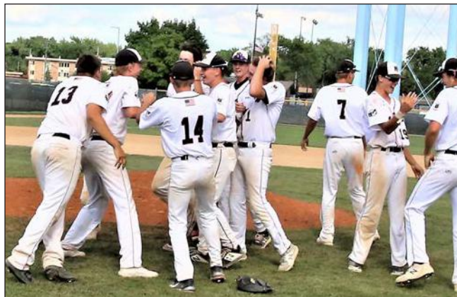
Div. I Junior champions New Prague celebrate after defeating Eden Prairie 7-2 at Red Haddox Field in Bloomington.