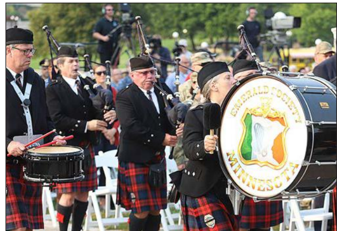
The Minnesota Police Pipe Band provided Scottish bagpipes and drums.