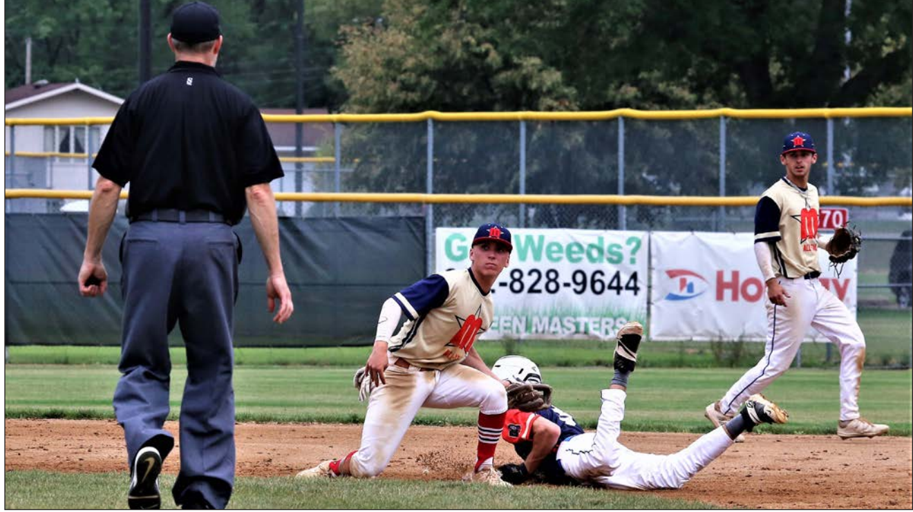
Bloomington's Red Haddox Field hosted the Div. I Jr. All-Star Tournament the weekend after the Div. I State Tournament. Here a Gold team player checks with an umpire to see whether the Blue team runner is safe. Scouts like to come to the All-Star Tournament to see Minnesota's up-and-coming talent.