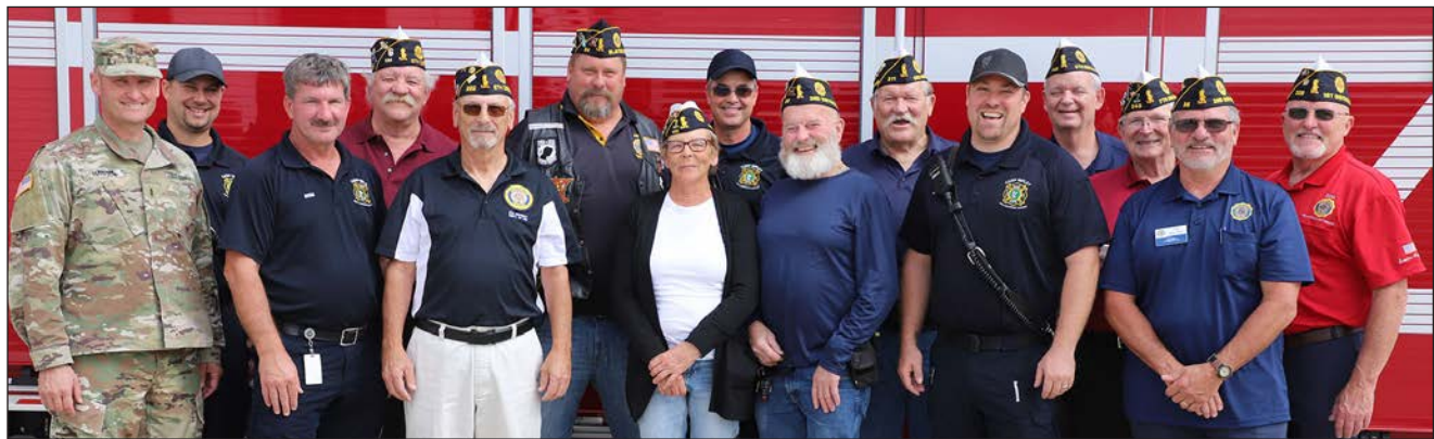
Several NS/FR Retreat participants had their photo taken with the on-duty firefighters at the Camp Ripley Fire Department on Sept. 18. They are standing next to a command center truck that had a price tag of $925,000. The fire department stands ready in case of an airplane crash, a base fire or to assist a nearby town with a blaze.