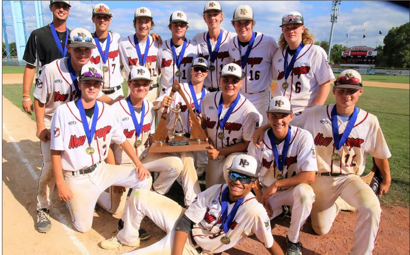
New Prague took home the hardware in the Div. I Junior State Tournament in Bloomington. Legion teams are generally based upon the school districts, which Legion calls a base area. This prevents the megateams often found in club leagues and makes games more competitive. Senior Legion Baseball is 19 down to 13, while Junior Legion Baseball is 17 down to 13. Images from the Div. I Tournament were in last month's issue.