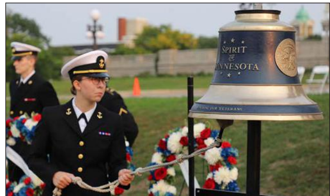
A sailor rings the Spirit of Minnesota bell on Sept. 11. The bell, cast by Verdin Bells & Clocks in November 2018, was rung each time after the name of a Minnesotan killed in the 9/11 attacks or the subsequent wars was read.