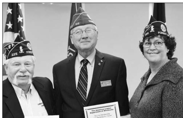
FOREST LAKE POST 225