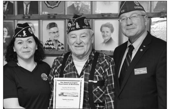
WELLS POST 210