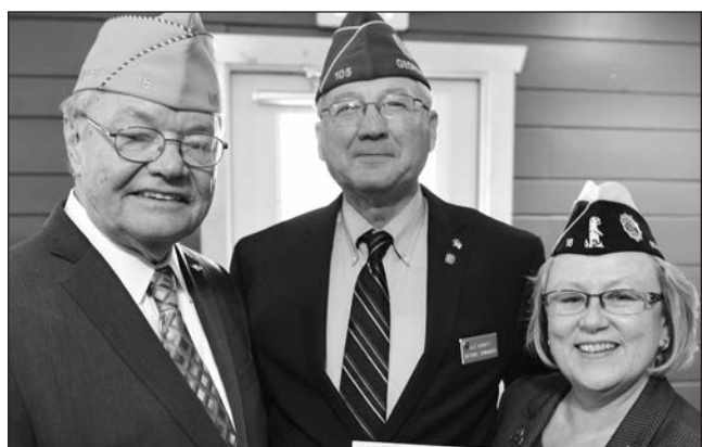
BAGLEY POST 16