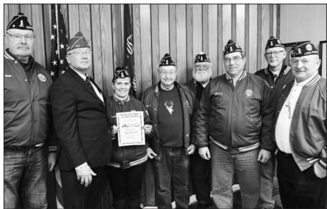
LONG PRAIRIE POST 12