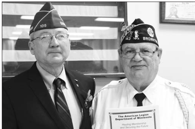
BROWNTON POST 143