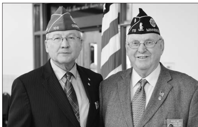
PLAINVIEW POST 179