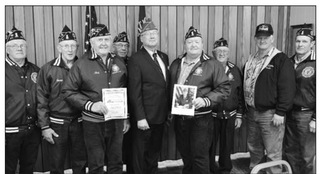
HOLDINGFORD POST 211