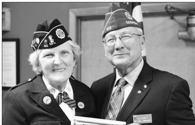
LANESBORO POST 40