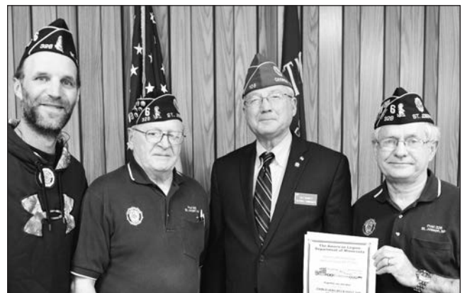
ST. JOSEPH POST 328