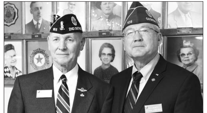
BRICELYN POST 165