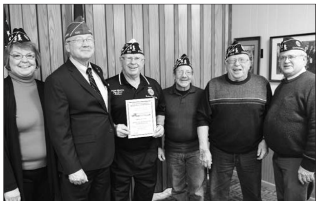
ZIMMERMAN POST 560