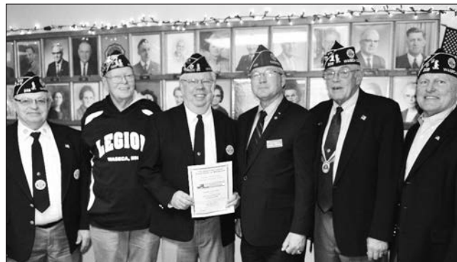
WASECA POST 228