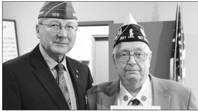
EYOTA POST 551