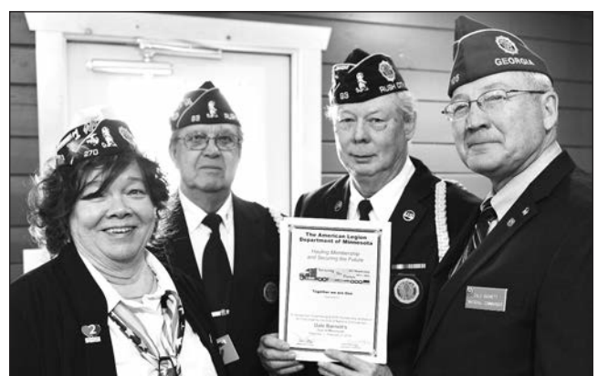
RUSH CITY POST 93