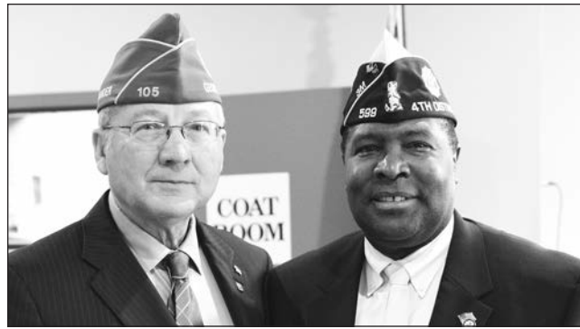
3M POST 599