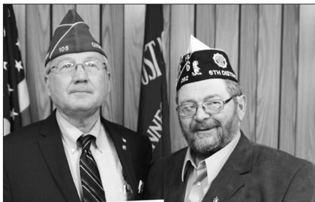
RICHMOND POST 292