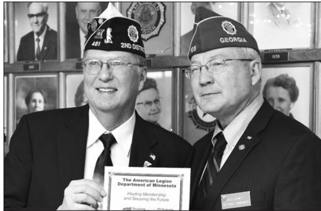
ROUND LAKE POST 461