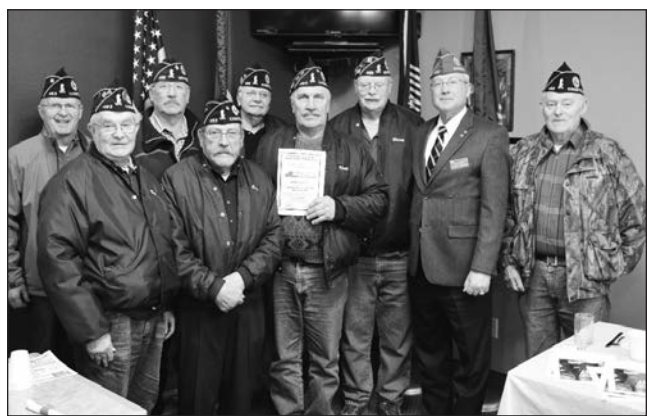
KINGSTON POST 483