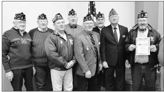
HAYFIELD POST 330