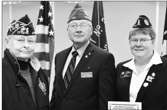
APPLE VALLEY 1776