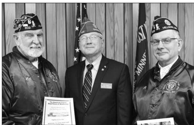
HILLMAN POST 602