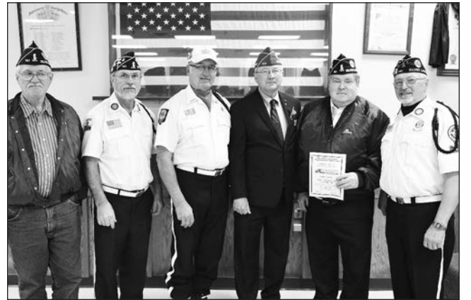
SILVER LAKE POST 141