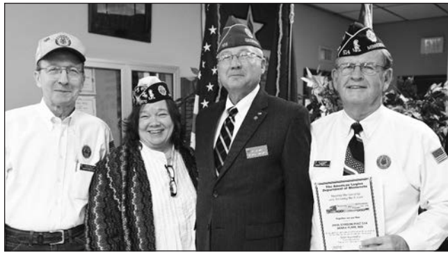
MAPLE PLAIN POST 514