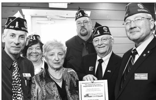
FRIDLEY POST 303