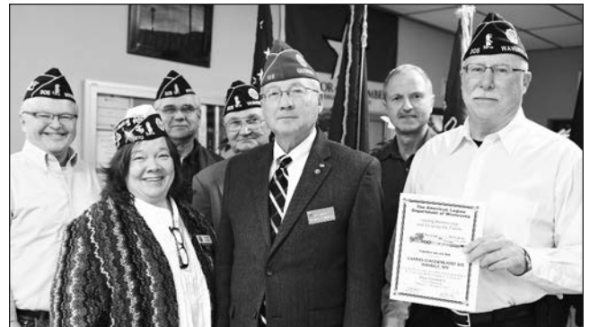
WAVERLY POST 305