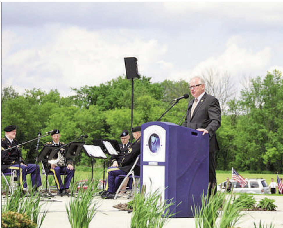
Rep. Tim Walz, D-Minn., was the featured speaker at the dedication of the MDVA's veterans cemetery at Preston. Behind him is the Red Bull Brass Band. The first burials at the cemetery took place on Veterans Day this past year.