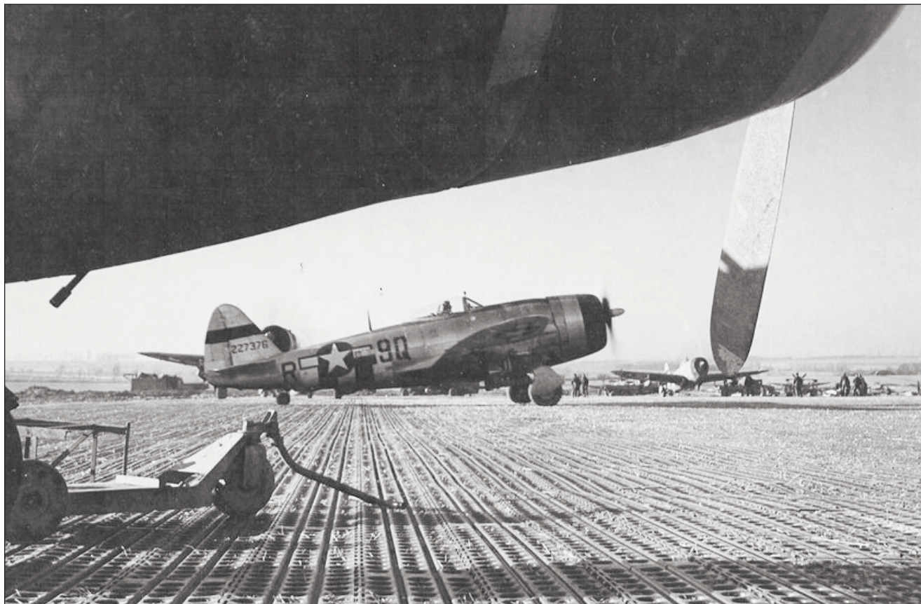
A P-47 Thunderbolt, part of the 371st Fighter Group is parked on an airfield in France. Note the Matson matting on the field. In order to build airfields quickly, the steel matting was used on most airstrips.

The prisoners were finally brought to their destination, Stalag I in the city of Barth on the Baltic coast in northern Germany. The town had never been bombed, probably because the Allies knew the POW camp was there.