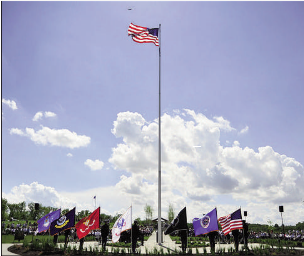
Minnesota's second state veterans cemetery was opened with a dedication in May near Preston. The 169 acres for the cemetery were donated by Fillmore County and have been beautifully landscaped. Construction was complete late last year. The cemetery will be operated by the Minnesota Department of Veterans Affairs.