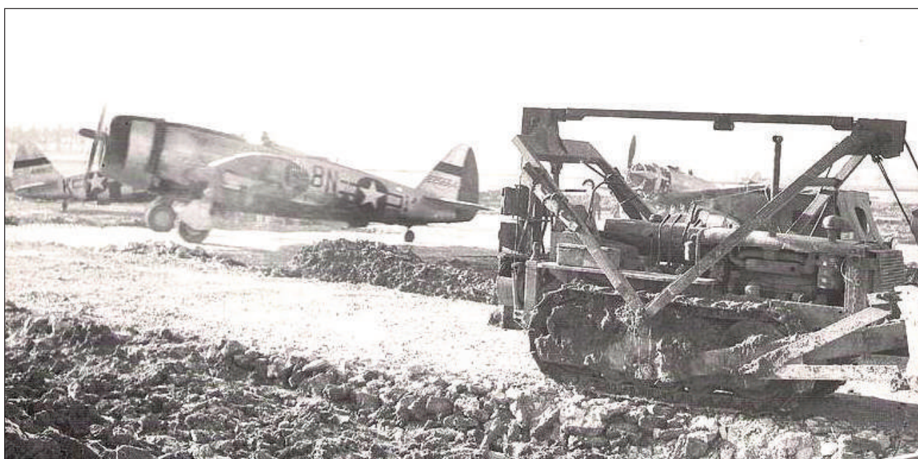
A bulldozer and a P-47 from the 371st Fighter Group share the same runway in France.