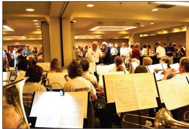
The Ninth District Band was tuneful at the event.