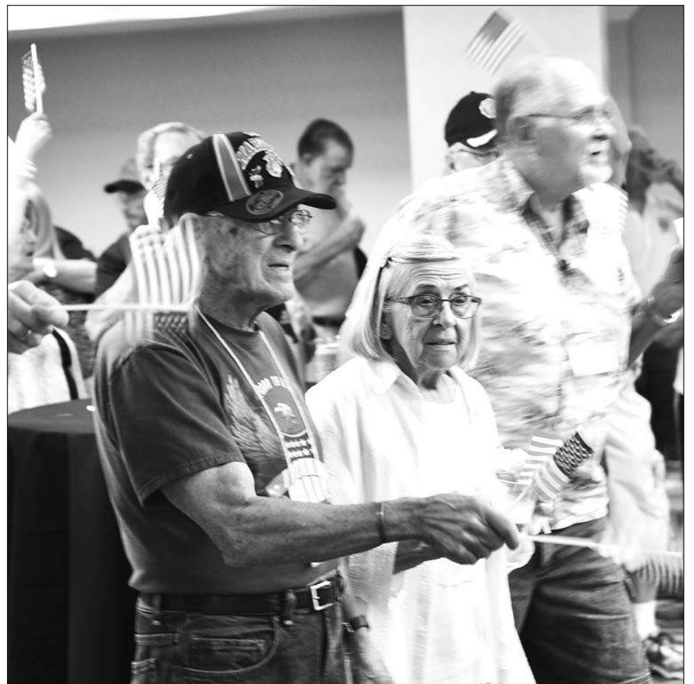
FLAG WAVERS -- Legionnaires and Auxiliary Members, SAL and Riders joined in to celebrate a patriotic song done by the Ninth District Band at the convention in Rochester.