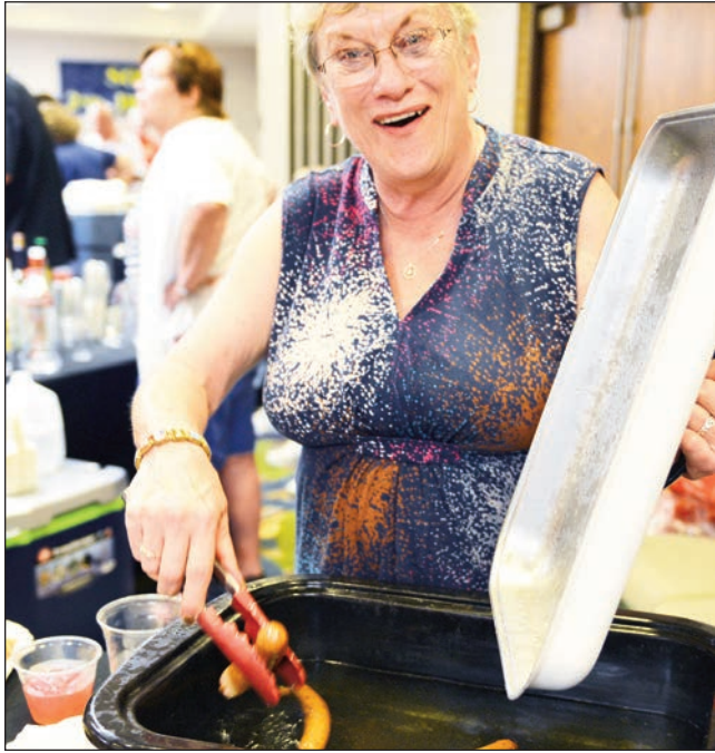
Hot dogs were a hot item at the hospitality event on Friday night at the convention.