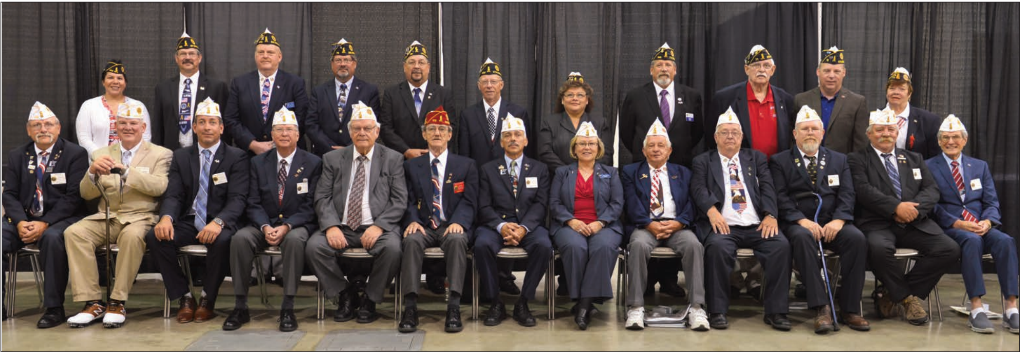
The 2016-17 leadership team had its official photo taken at the conclusion of the convention.