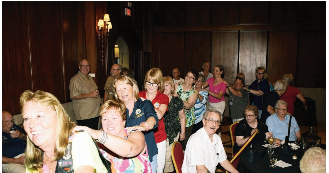
During the Thursday night Auxiliary reception, a conga line got things moving.