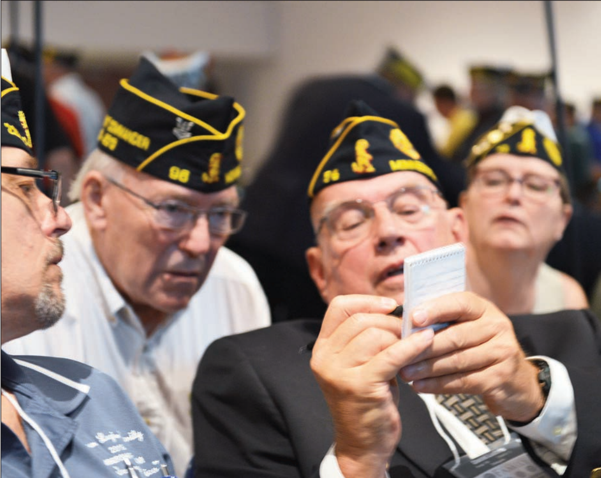
With an election impending, members of the Third District gathered for a caucus to go over the district's voting strategy.