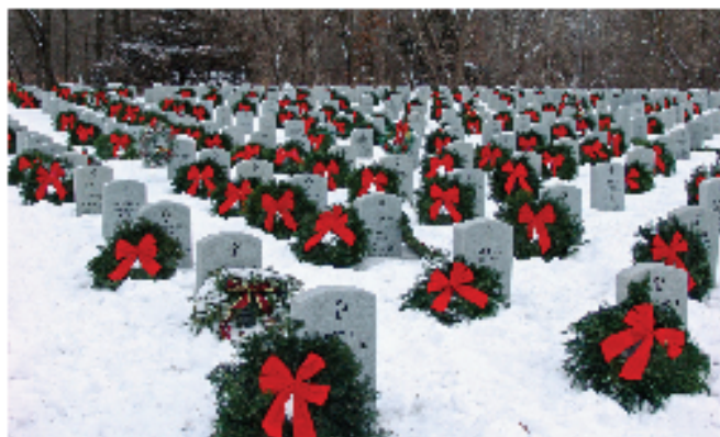
Minnesota State Veterans Cemetery

(We don't share your e-mail address with anyone)